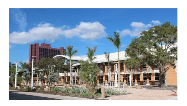
Beginning Genealogy Research Fort Myers Regional Library Genealogy Room 2<sup>nd</sup> Floor August 5, 2021

This study guide introduces patrons to the field of genealogy. The Fort Myers Regional Library offers a number of excellent "how-to" books on the subject of genealogical research. These materials are shelved in both the adult and juvenile non-fiction areas under the call number 929.1. We also have over 200 informational study guides on a variety of specific subjects pertaining to genealogical research. Patrons may obtain electronic copies by contacting Bryan L. Mulcahy via e-mail at <a href="mailto:bmulcahy@leegov.com">bmulcahy@leegov.com</a> or via telephone at (239) 533-4626.